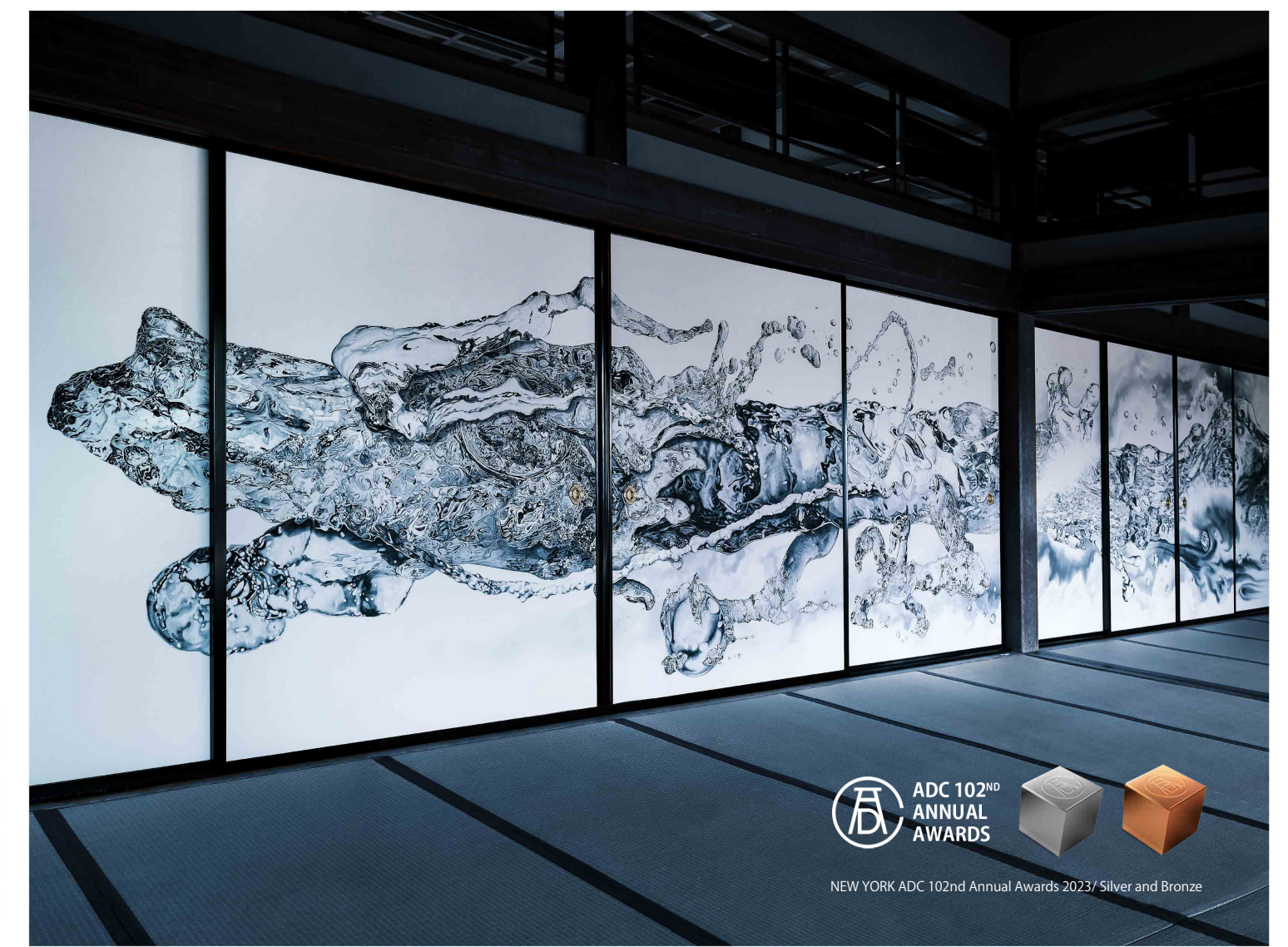
Unryu-zu* | Total length: W9.87m x H 1.83m | Production time: 6 years | Painted on 8 panels of fusuma (sliding paper partitions) | Public viewing: 26th June, 2022 – 22nd July, 2022 | *Unryu-zu: painting of dragon and clouds