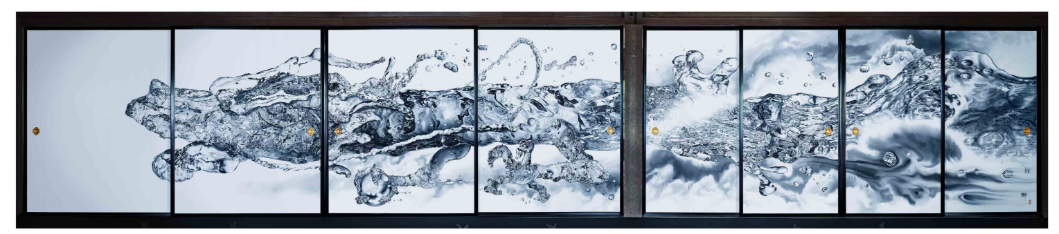
The storm on the right side portrays the current social challenges (under COVID-19 and the global conflicts), while the blank space on the left represents light. These are a reflection of the artist's wish for a bright future ahead for all mankind. The fusuma painting will be displayed for the public once every year and will be passed down through centuries and centuries to come.