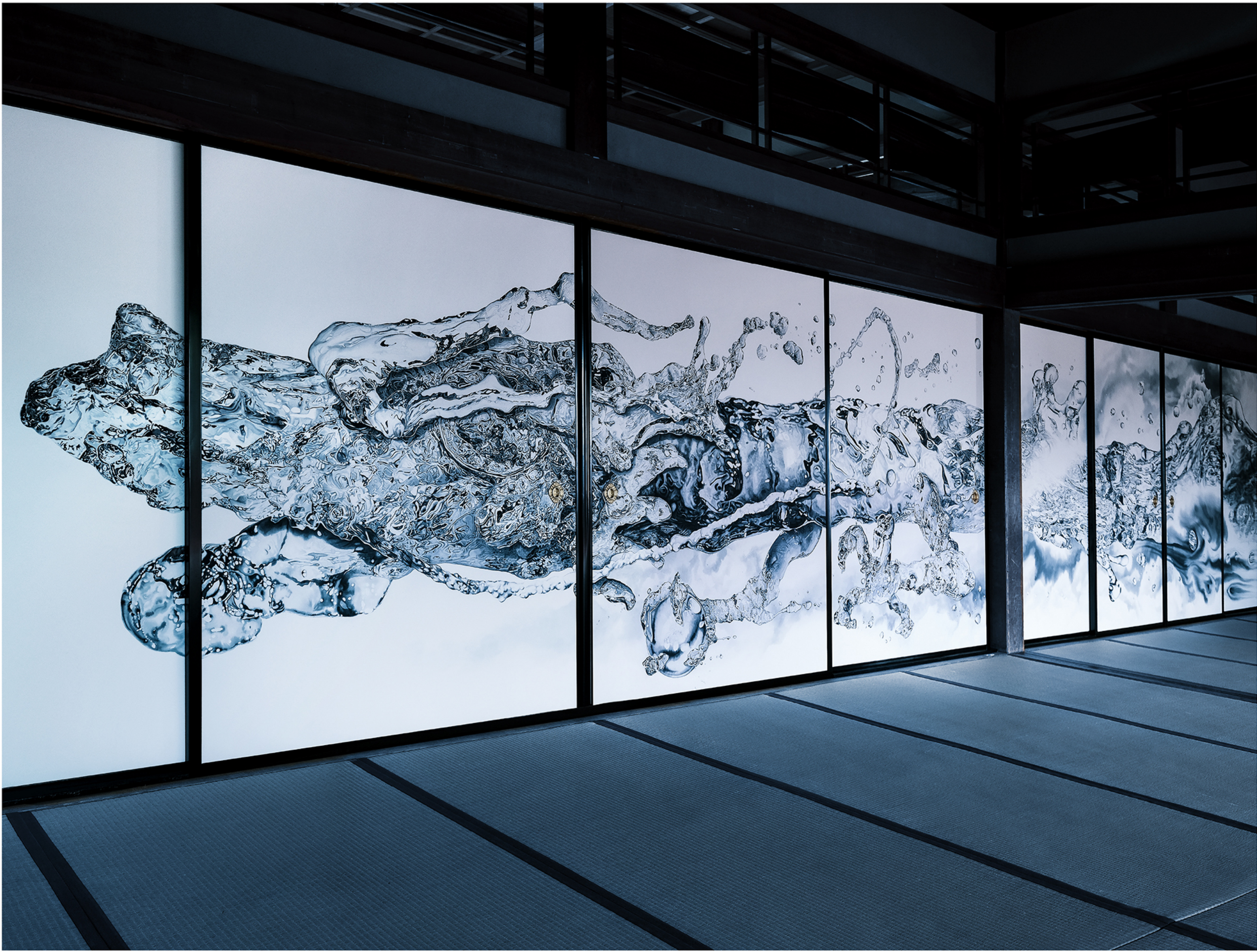
“Unryu-zu” by OHGUSHI | Total length: W9.87m x H 1.83m | Production time: 6 years | Painted on 8 panels of fusuma (sliding paper partitions) | “Unryu-zu is a Japanese term that means “painting of dragon and clouds”