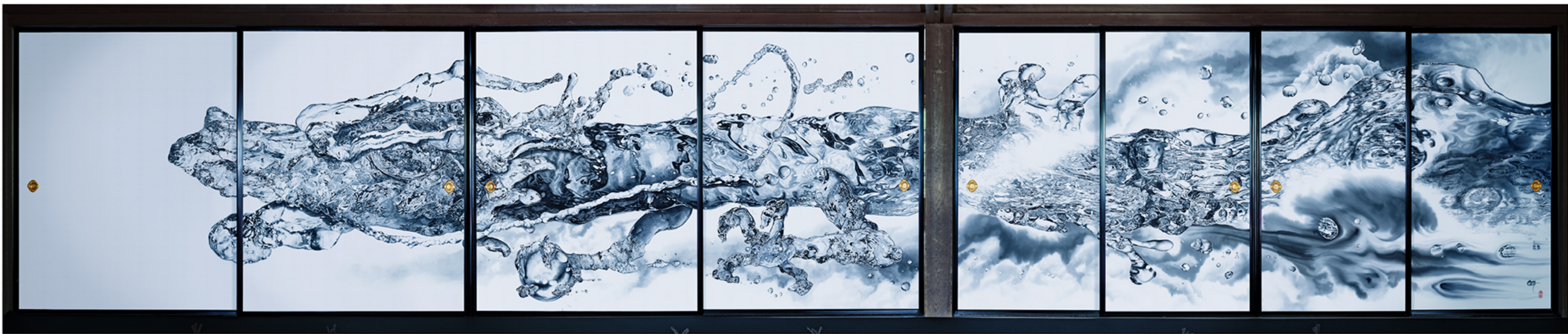
The storm on the right side portrays the current social challenges (under COVID-19 and the Ukraine war), while the blank space on the left represents light. These are a reflection of the artist’s wish for a bright future ahead for all mankind. The fusuma painting will be displayed for the public once every year and will be passed down through centuries and centuries to come.