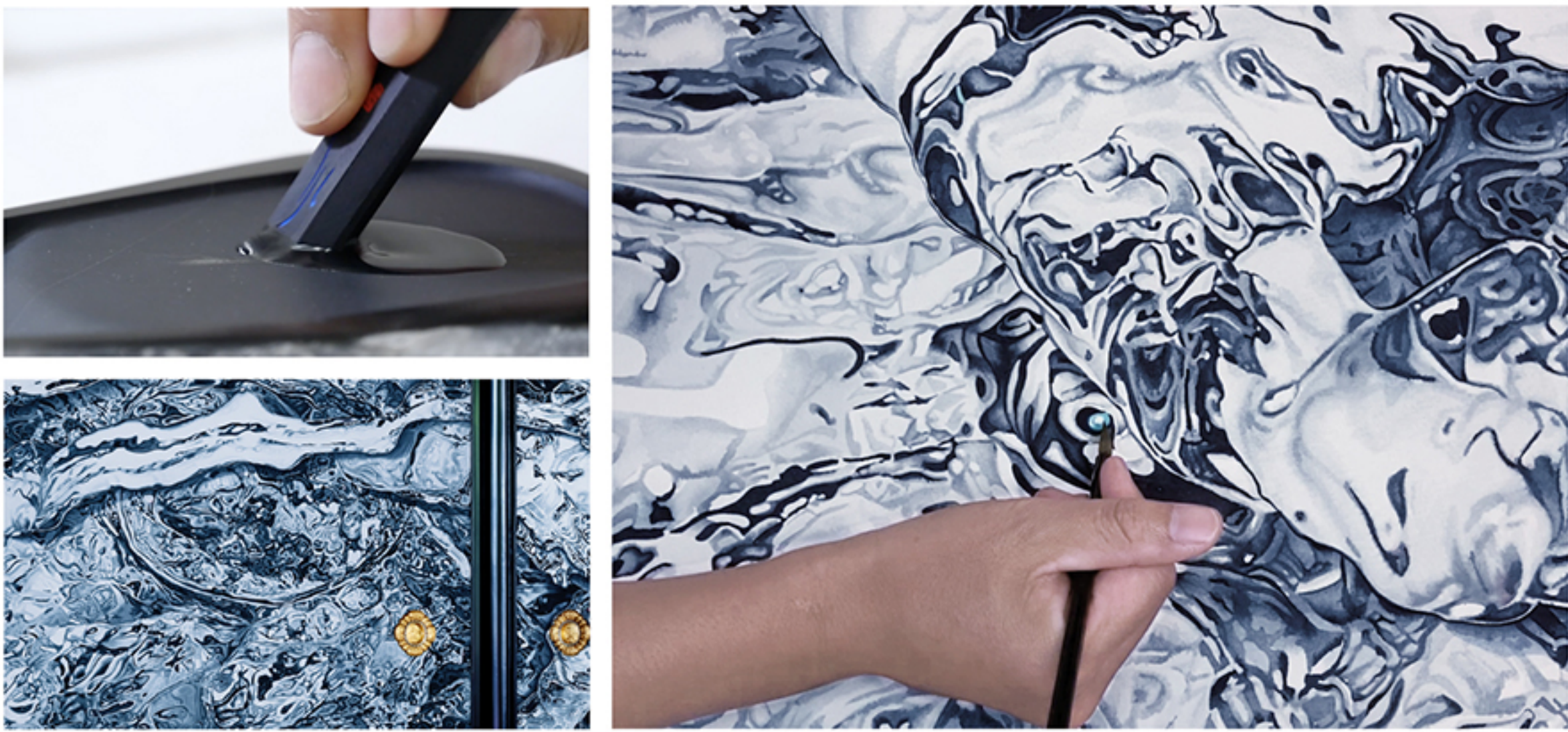
The painting stretches 10 meters long and was painted with traditional Jols in a series of meticulously detailed renderings.